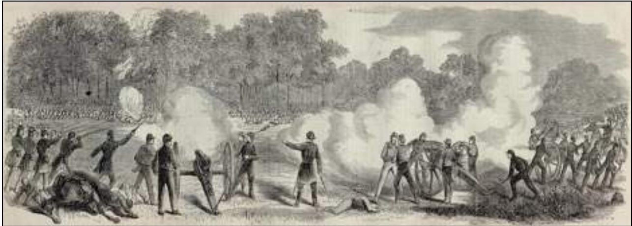
“The Army of the Potomac - Furious attack of the rebels on Kirby’s battery at Fair Oaks. Sketch by Mr. Mead.

One reason for the lack of attention is the battle is considered a draw, a deadly but indecisive clash that resulted in little but damage to both armies. Perhaps we have an illogical or indefensible tendency to “keep score,” and see battles as wins or losses, like a sporting contest,