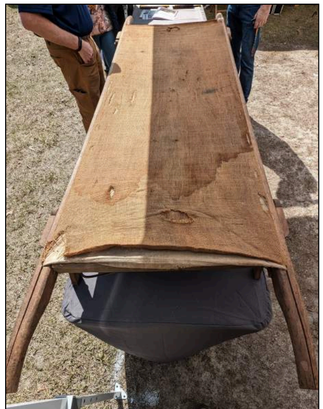
Medical equipment on display in Bentonville.