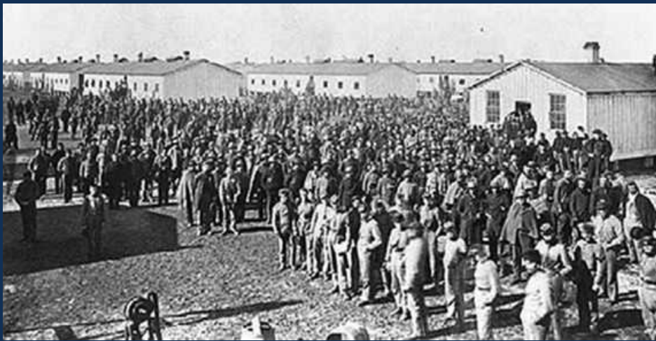
Confederate prisoners at Camp Douglas, Chicago, Illinois